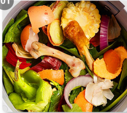
Crush the hard bones