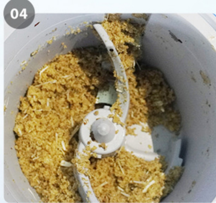
Drying and deodorizing