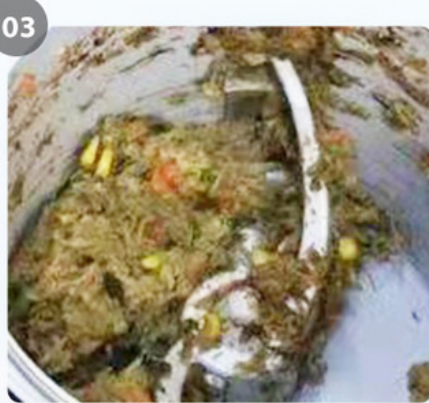
High efficiency dehydration