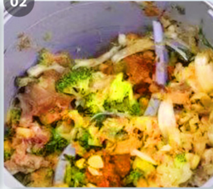
Smash to pieces